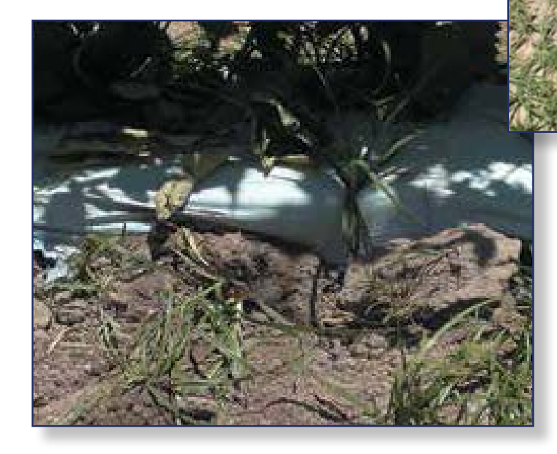
© 2020 Loveland Agri Products. Always read and follow label directions. WaterMaxx is a registered trademark of Loveland Agri Products.